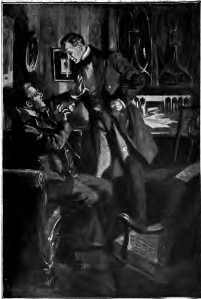
The doctor stood over the captain with eyes blazing and fists tightly clenched.